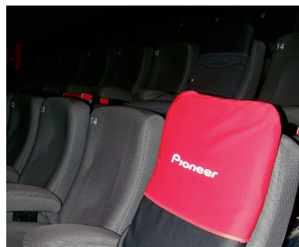
The 'feeling chair' transforms sound into vibration and makes music, spoken language or other sound 'feelable' to persons with hearing impairments.

Intro vzw also launched the 'feeling chair' in Flanders. This is a large cushion that can be placed on a chair and transforms sound into vibrations. With the help of a Flemish sign language interpreter, both the content and emotions of the music are expressed in spoken language in addition to the 'feeling chair'. Blind and visually impaired persons can enjoy concerts, movies, and football games by means of a headset which enables the guest to receive additional information from a live commentator. Since an event's floor is not always flat, Intro vzw offers metal ramps to overcome small level differences.