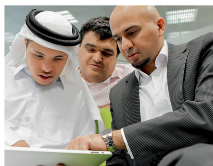
Mada is a one-stop-shop for all aspects of accessible technology for persons with disabilities: a young man explores using an iPad with two Mada team members.

The Mada model of services is already influencing regional services in Oman, Dubai, Kuwait and Shahjah, with interest and relations building in Saudi Arabia and Egypt. The availability of free technology for Arabic speakers supported by Mada has an impact throughout the Arabic-speaking world.