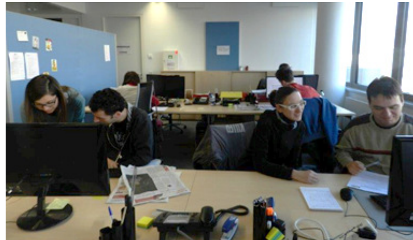
This is where we work