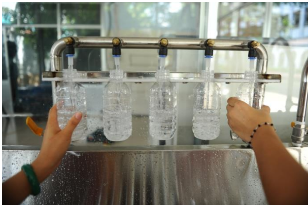
Semi-automatic water filling