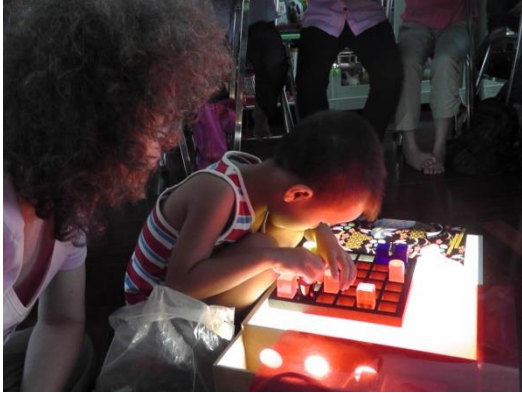
Lightbox & flash cards