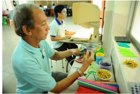
Geometry teaching device